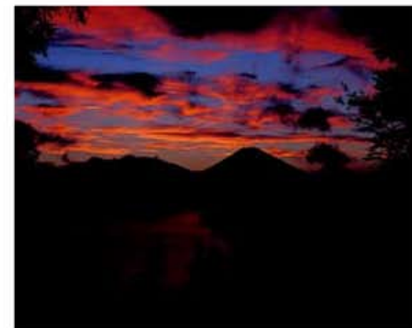
< 流雲 - 朱II - Racing Clouds - Vermillion II -> 2000