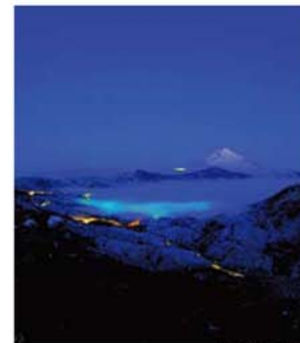
< 蒼 - Bleu -> 2002