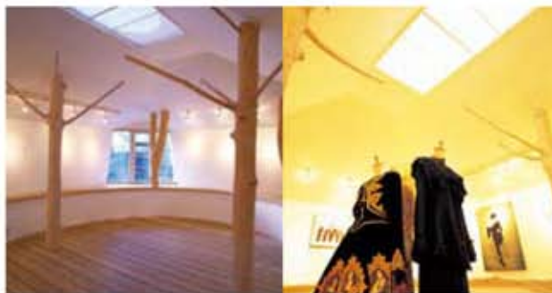
<Mariko Kobga 25th Anniversary Exhibition> 2003

The 2F gallery presents special exhibitions by up-and-coming artists from Japan and abroad. It is also used to present gallery talks and photography classes on the theme of Hakone's seasonal beauty.