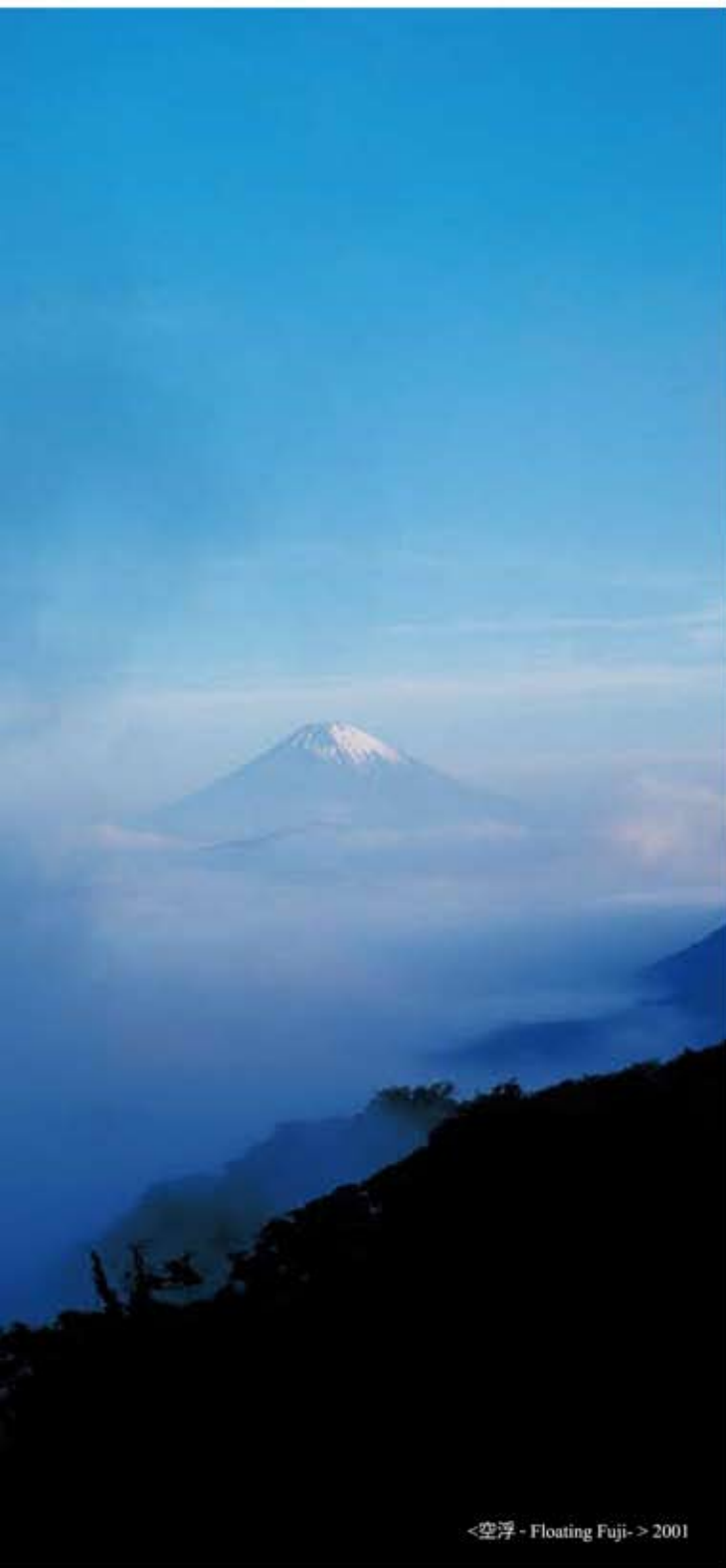
<空浮 - Floating Fuji -> 2001